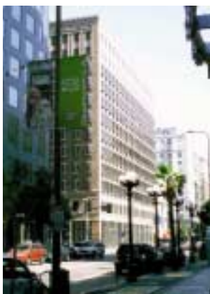
7th and Hope streets in Downtown LA.

The DCBID's Economic Development team hosted a meeting on August 15th to jumpstart the revitalization of 7th Street from Figueroa Street to Olive Street. Many stakeholders of 7th Street, as well as the adjoining streets, attended the meeting.