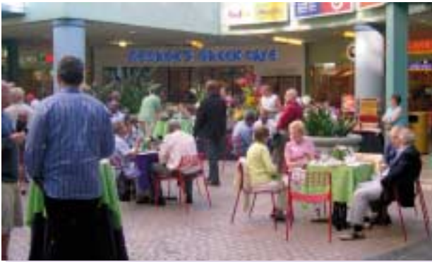
Concierges enjoying food and entertainment at 7+FIG.

The evening began at 7+FIG Shopping Center where Arnie Morton's Steakhouse and George's Greek Deli prepared delicious food and cocktails. One guest said, "I walk past 7+FIG every day and didn't realize there was a whole mall with a cool courtyard. I always thought it was just Robinsons-May." After brief welcoming remarks and