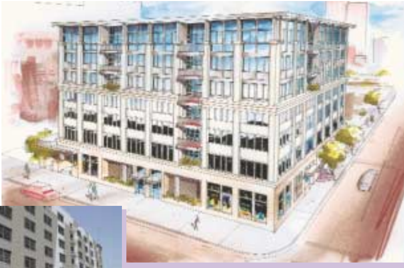
Grand Avenue Lofts at 11 th and Grand