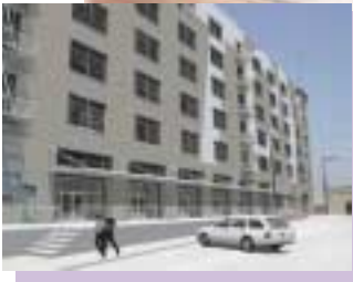
The Toy Factory Lofts in the Artists District

S purred on by the tremendous success of the Flower Street Lofts development located across from Staples Center, The Lee Group has embarked on its second condo development in the former UCLA Extension Building located at the southeast corner of 11th Street and Grand Avenue. The Grand Avenue Lofts will have a total of 66 loft-style luxury units and should be ready for occupancy by the end of 2004.