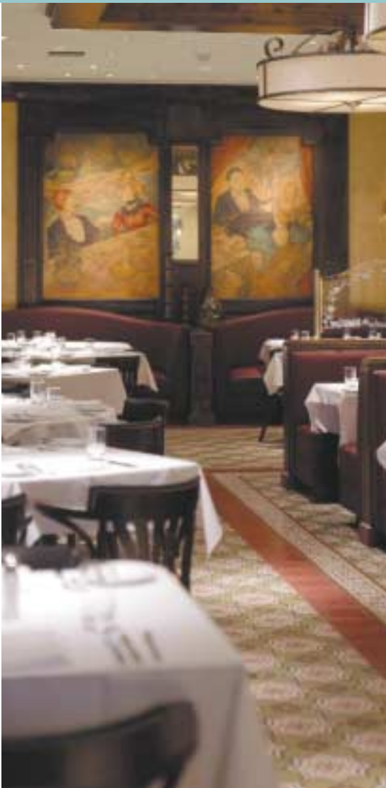
Kendall's Brasserie at the Music Center

D owntown Los Angeles has recently welcomed four new restaurants. Here's a brief description of each one: