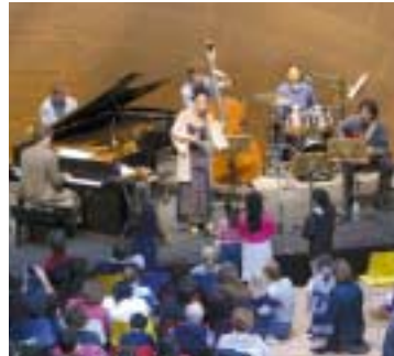
Taste of Downtown LA and other activities at last year's Creation Festival on Grand Avenue.