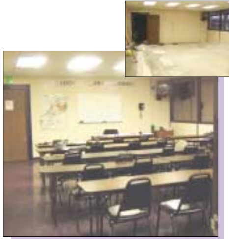
Briefing room – before and after.

Please stop by to see the new and improved Service Center.