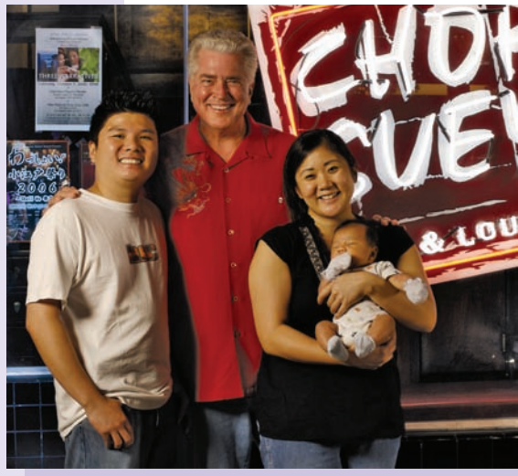
PBS host Huell Howser with owners of recently opened Chop Suey restaurant in Little Tokyo.

The first three episodes appeared on KCET in early October and featured a French restaurant off an alley on Seventh Street, the newly restored Chop Suey Café in Little Tokyo, Evans Community Adult School and Gallery Row's Art Walk. Another episode looks at the National Biscuit Company Factory Building and airs on November 10 at 6 pm and 12:30 am and again on November 27 at 6 pm.