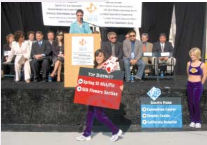
Laker Girls “modeling” signs at Downtown LA Walks press conference.

The Downtown LA Walks program is the culmination of an effort driven by the DCBID and Confederation of Downtown Associations with additional oversight provided by the Los Angeles Department of Transportation, Metropolitan Transit Authority and the Community Redevelopment Agency. The cost was just over $2 million.