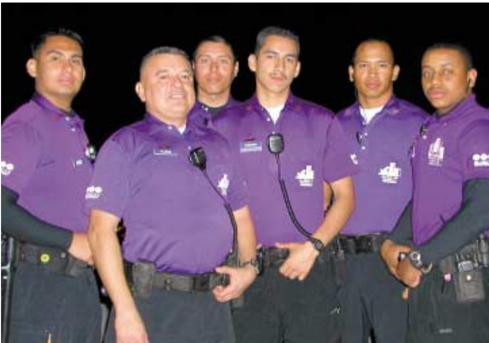
DCBID Purple Patrol.