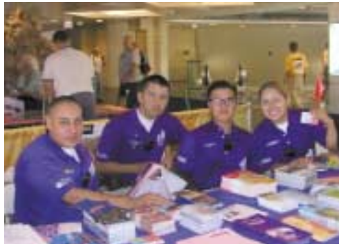
DCBID Purple Patrol Ambassadors distribute brochures and maps at the opening of the Gold Line.

The opening of the new Metro Gold Line connecting Pasadena and Downtown LA drew more than 200,000 people over two days, July 26 and 27. Thousands stopped by the DCBID booth at Union Station to ask questions about Downtown and pick up brochures from more than 30 different businesses. The Purple Patrol Ambassadors, as well as the DCBID Marketing and Economic Development departments staffed the booth. 50,000 "Discover Gold" coupon books produced by the DCBID and featuring more than 75 different offers, were distributed at Union Station and seven other stations along the Line in less than 12 hours!