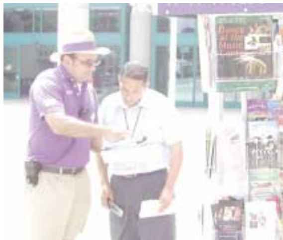
DCBID Ambassador using new PDA system

The DCBID Ambassadors wear purple shirts, straw hats, khaki pants and have a friendly demeanor that easily identifies them as Downtown guides. They know the latest information about what's happening at Downtown's attractions and also have easy access to MTA information.