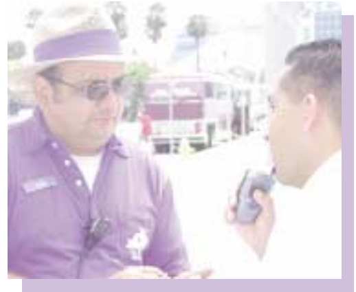
DCBID Ambassador assisting visitor

The new tool is a hand-held computer or PDA that is downloaded with mapping and GPS information that enables the DCBID Ambassadors to quickly locate any destination requested by the public and print walking directions on their hand-held printers. For example, if someone stops by the kiosk at Macy's Plaza and requests directions to the Walt Disney Concert Hall, they will be given a small sheet of paper with walking directions from 7th and Flower to 1st and Grand.