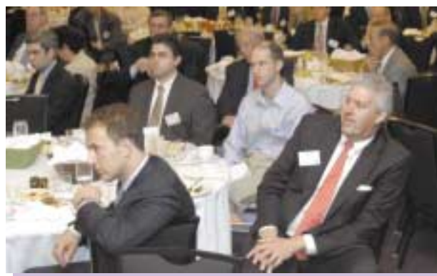
Audience members listening intently to presentations about investing in Downtown LA

Downtown with the Walt Disney Concert Hall, new restaurants and the hip Standard Hotel."