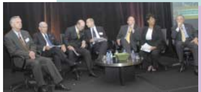
Panelists on stage during presentations