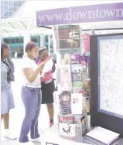
Downtown visitors at the new DCBID kiosk

The DCBID has purchased two new kiosks that are used to distribute brochures, maps and coupons from Downtown businesses including the Music Center, MOCA, Ciudad, St. Vincent Jewelry Center, Omni Hotel and many others.