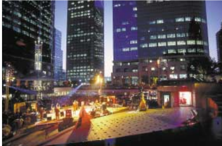
Grand Performances on stage at California Plaza

G rand Performances is Southern California's largest presenter of free performing arts programs. Located in Downtown Los Angeles at California Plaza, Grand Performances' mission is to bring together the diverse peoples of Los Angeles for concerts celebrating the cultural contributions of our community.