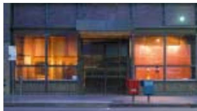
Phantom Galleries LA exhibit at 515 West 7th Street.

A new kind of art gallery has opened Downtown and it's called Phantom Galleries LA. The concept is new to Los Angeles, but already popular in Boston and San Jose.