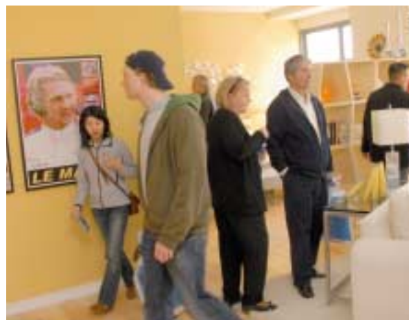
Condo buyers view Sky Lofts at 801 S. Grand Avenue.