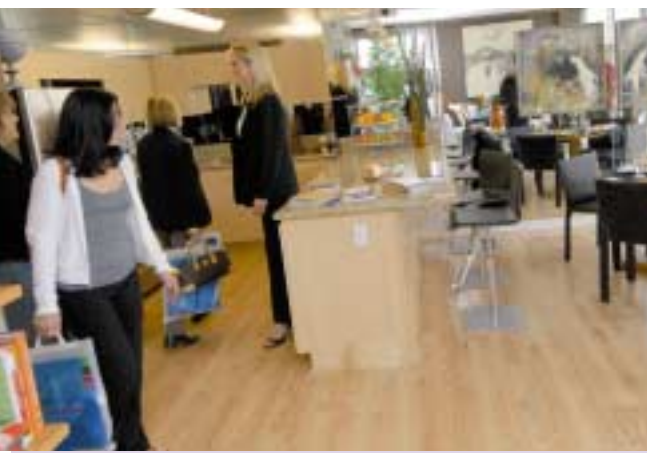
Downtown Living Weekend participants view Library Court at 630 West 6th Street.

Several thousand condo buyers and loft renters attended the Downtown Center Business Improvement District's 2nd Annual Downtown Living Weekend held on Saturday, March 25 and Sunday, March 26. Fourteen projects located throughout Downtown opened their model units and sales offices for tours.